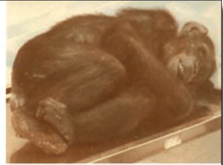
The body of Lola Died in Samoa 17 November 1999