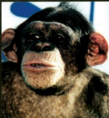
Sonny, still captive and alone.

SAFE has campaigned on your behalf for many years to end animal circuses. With your help, we can make this a reality. Let's make NZ an animal-circus-free zone.